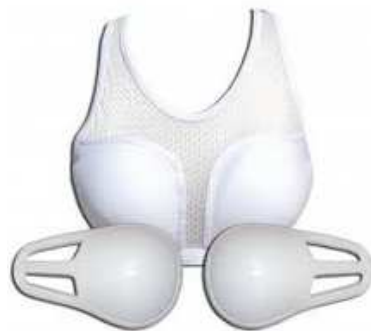
Homologated breast protection for women